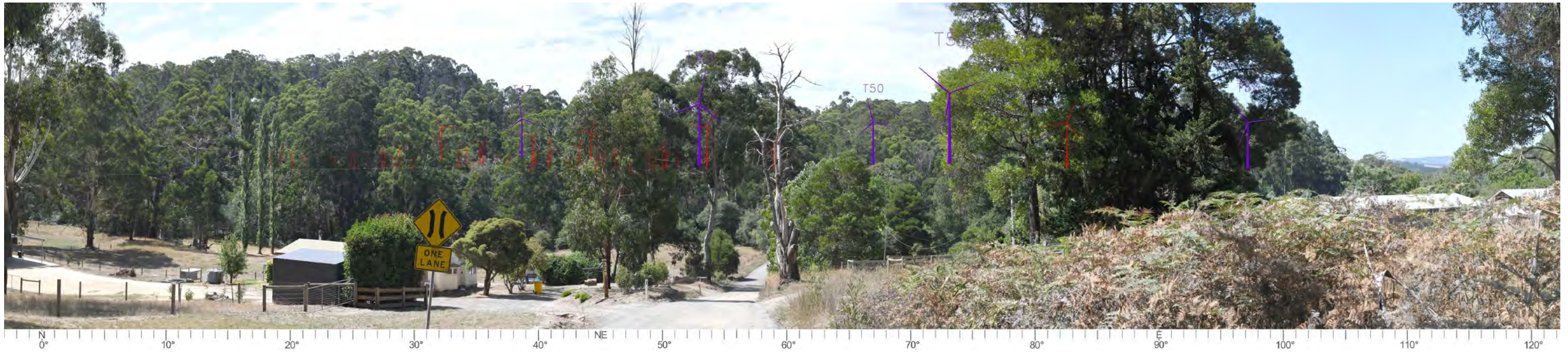
Wireframe - Labelled view (Concept Layout - V1.5)